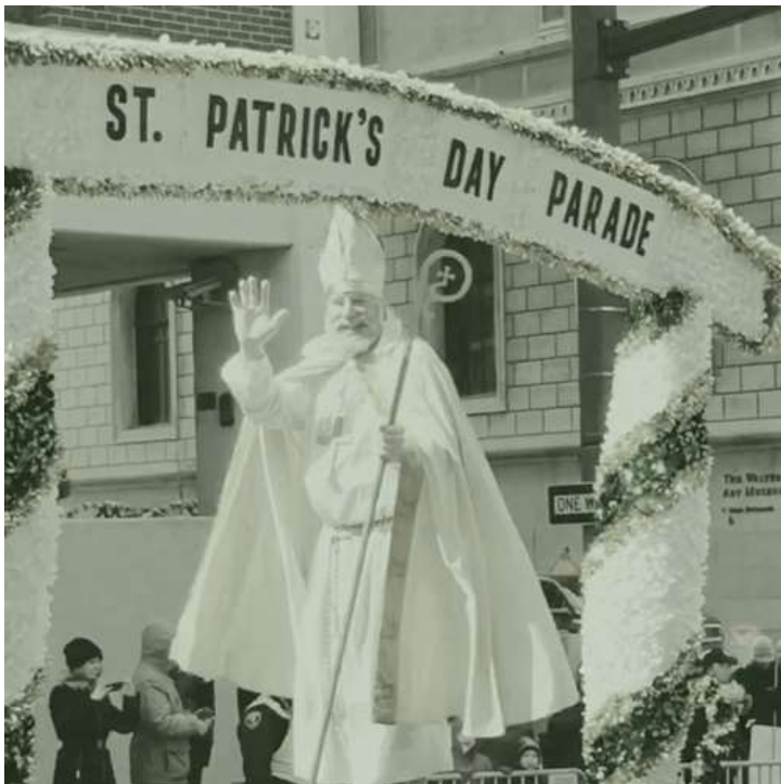
Saint Patrick's Day in Mount Vernon — March 12, 2017 @wesleystuckey