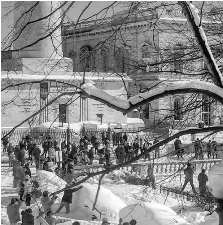
Snow Day — January 24, 2016

We look forward to an exciting new year in Mt. Vernon. See you Tuesday evening!